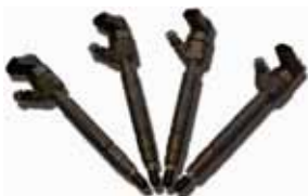
Common Rail Injectors