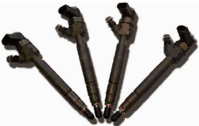
Common Rail Injectors