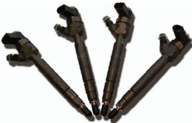
Common Rail Injectors