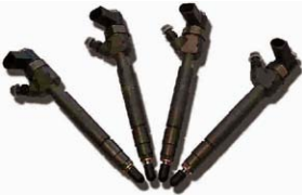
Common Rail Injectors