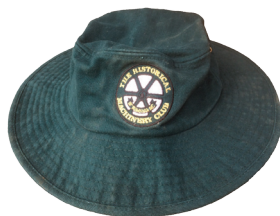
Club Brim Hat $12