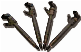
Common Rail Injectors