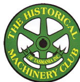
Club Sticker $1

Styles may vary according to availability