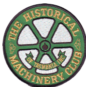
Club Cloth Patch $10