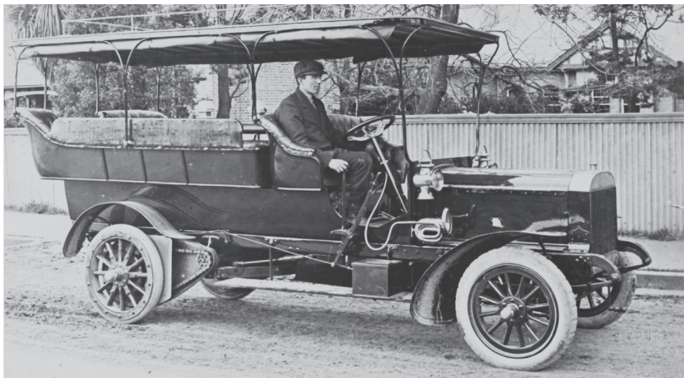
Finlayson 8 passenger car. Circa 1901 built by Finlayson Bros & Co, Devonport Tasmania. Imported engine, gearbox & tyres and rims.